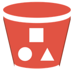
AWS S3 Bucket Management